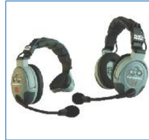
Duplex Wireless System