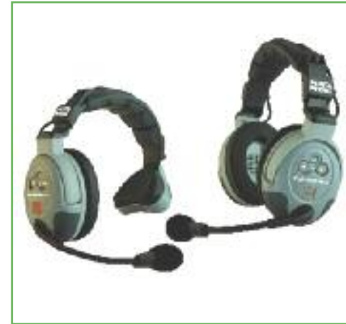
Duplex Wireless System